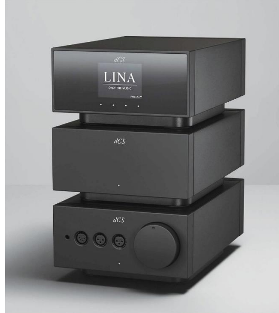
Headphone amplifier needed

These headphones are one of the best on the market today.